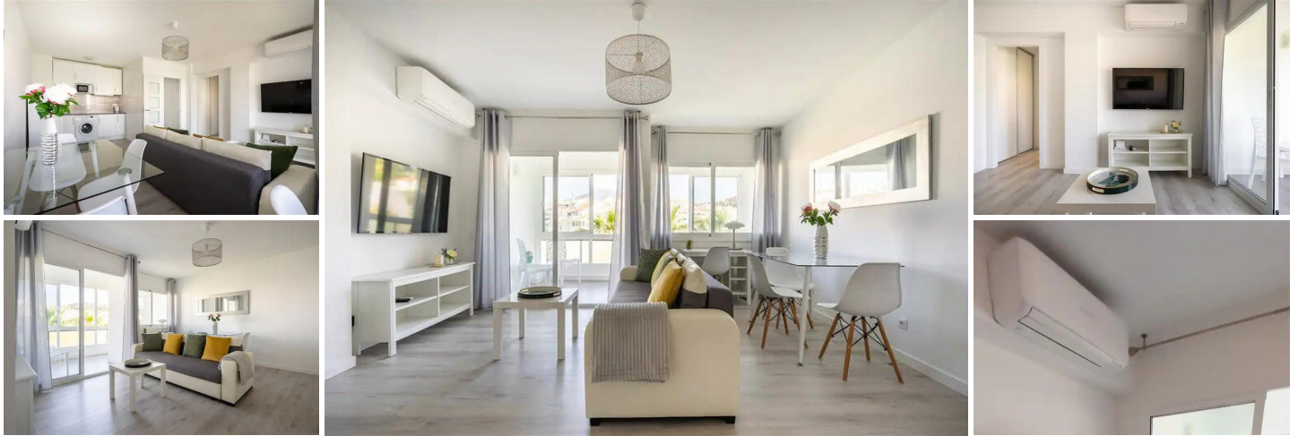
Modern 1-Bedroom Apartment in Nueva Andalucía – Ideal Location & Stylish Living

This beautifully renovated 1-bedroom apartment is located in the sought-after area of Nueva Andalucía, just minutes away from the vibrant Puerto Banús and San Pedro de Alcántara. With the beach only a 5-minute drive away, you'll enjoy the perfect balance of tranquility and convenience, with shops, restaurants, pharmacies, and health centers all within easy reach.