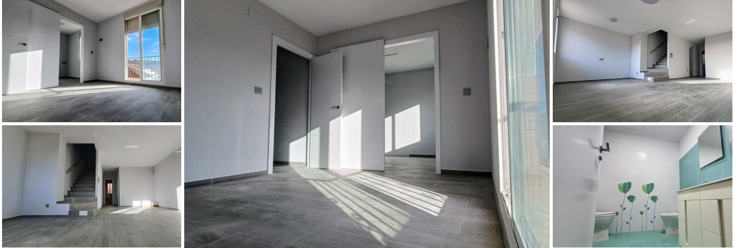
Townhouse for sale in La Romana, Alicante, Costa Blanca