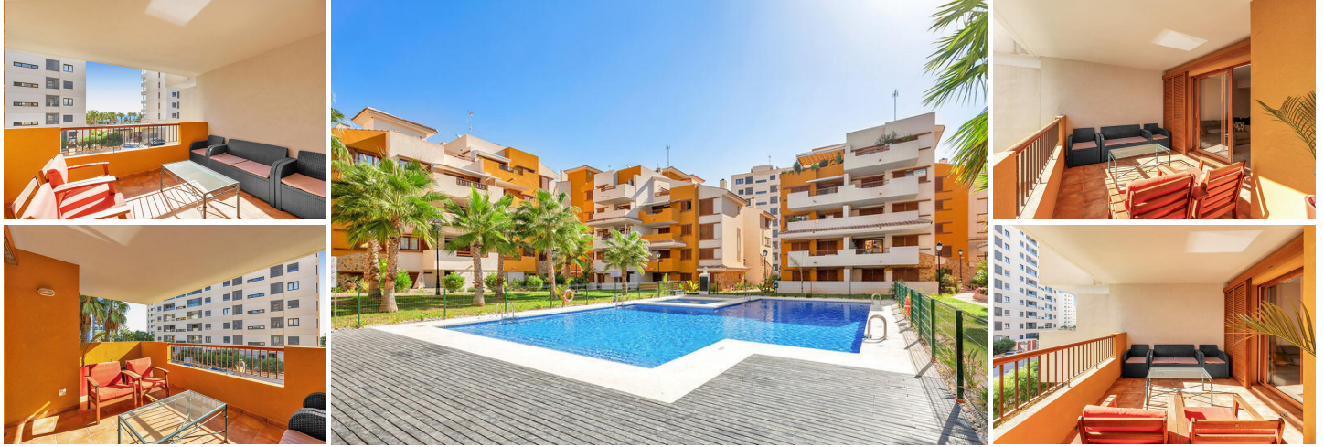
Spacious apartment in La Recoleta, Punta Prima.

The Mediterranean style urbanisation is characterised by beautiful and spacious communal garden areas. It has 24 hour security and video surveillance. The residential consists of several blocks of flats with a maximum height of 5 floors. It is distributed in 3 bedrooms, 2 bathrooms, one of them en suite, kitchen, living room and terrace of 14m 2 . It also includes underground parking and storage room. The residential has 3 communal swimming pools for children and adults.