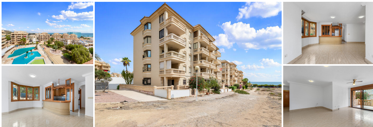
Ground floor apartment with big terrace in Guardamar del Segura

This ground-floor apartment, with a living area of 82 m 2 , offers everything you need for a relaxed life by the sea. It features a spacious 57 m 2 terrace that surrounds the property, perfect for enjoying the outdoors or spending time with family and friends.