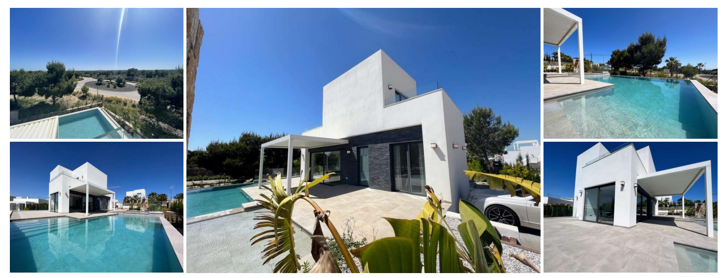
Recently built beautiful villa located in Las Colinas that is fully furnished and move-in ready. Has a rental licence.

Upon entering the property you immediately enter the living area and spacious open plan kitchen once you have passed the stairs to the first floor and a guest bathroom. On the ground floor, there is one bedroom with a spacious bathroom. From the living room and lounge, you have direct access through the large sliding windows to the terrace and the beautiful swimming pool. The terrace is also fitted with a large pergola equipped with an electrically operated slat system which you can set at any angle to block out the sun, if needed. The large infinity pool is built in an L-shape with an extra shallow platform to properly enjoy the sunny days. On the first floor we find 2 bedrooms and a bathroom. Both bedrooms have access on the terraces.