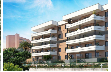
SUNHILL New Phase

Sunhill is located in a residential area with endless possibilities, located just 2 kilometres from the sea and a 5 minute walk to the centre of Los Pacos, Fuengirola.