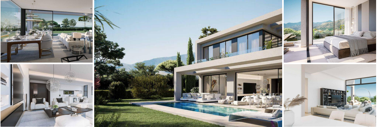
BENAHAVIS ... 4 Bedroom Villa

Completion date is between 2024 and 2025