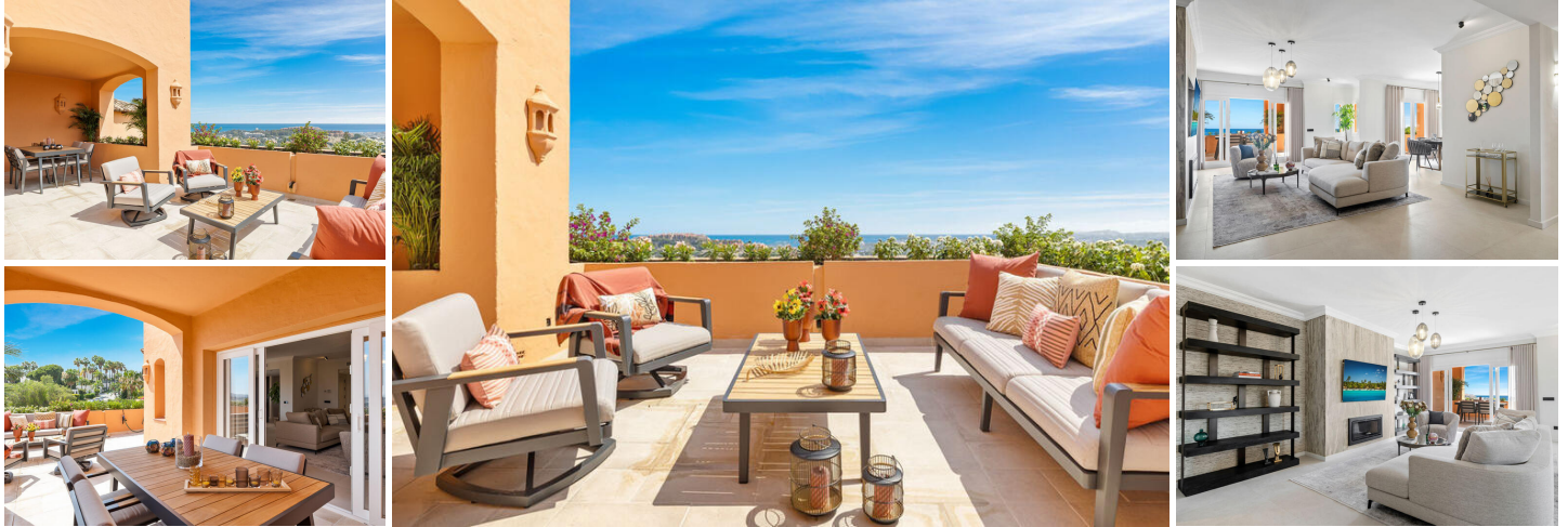
Fully renovated duplex Penthouse in La Cerquilla, NUEVA ANDALUCIA

The penthouse "Pavilion" is located on the heights of Nueva Andalucia, a renowned area of Marbella with residential and luxury properties. The penthouse has been renovated with the highest standards, facing south west with wonderful panoramic views to the Mediterranean, the coast and the mountains.