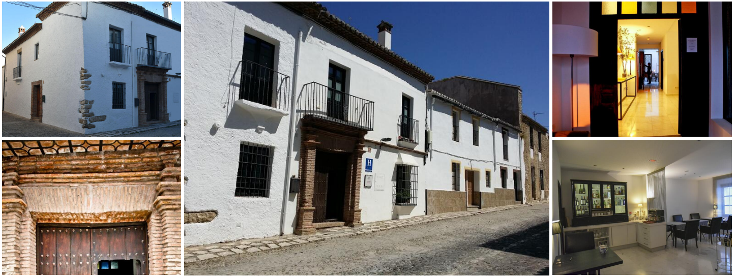
Ronda – Exclusive 4 star Boutique Hotel ( Restaurant Licence )

Excellent opportunity to acquire this exclusive 4-star Boutique Hotel with 4 Double Rooms in the Historic Center of Ronda. Trading since 2013 and always maintaining a very high rating and excellent reviews.