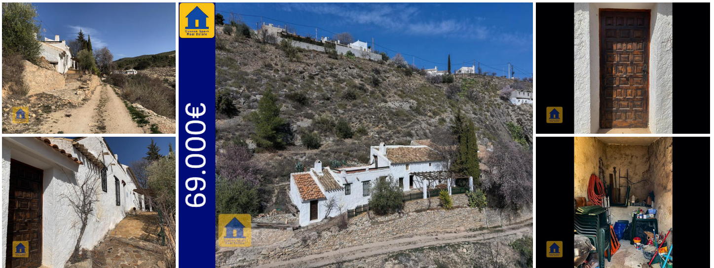
Casa Cristina in Duda

If you are looking for a holiday home or full time home in a beautiful, remote spot, this house might be for you! This delightful and quaint little house is located on a hillside of the charming hamlet of Duda, about a mile from the San Clemente reservoir. The house has views across the lush valley and you can hear the stream running down below. The property is attached on one side to a house that is not inhabited. The next neighbour is about 70m down the track.