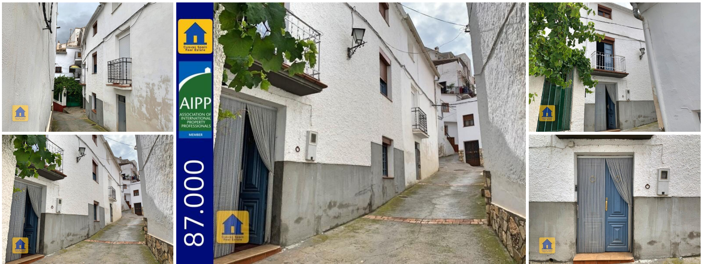
Town house loles castril

Large town house full of character in the center of the stunning village of Castril. This house was built in 1919 and is located on a narrow, winding, cobblestone street. The street has vehicle access for unloading only. The house is on 3 storeys with wide staircases, a large landing on each floor, and a courtyard at the back of the property.