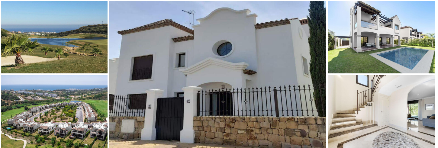
Villa MAJESTY - First Line Golf - West Estepona

This detached villa, surrounded by golf courses, is ideal for nature and golf enthusiasts, as it is located just 5 minutes from the beach. Additionally, it is near major shopping areas and the hospital and is a 10-minute drive from the center of Estepona.