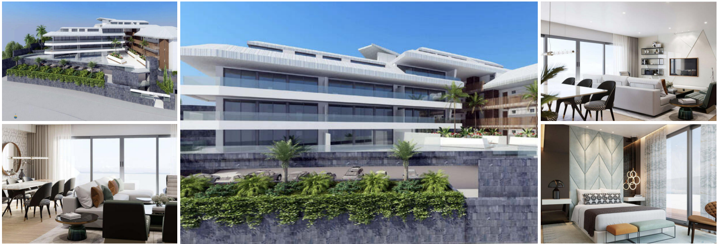
PENTHOUSE - TORREBLANCA

This stunning penthouse located in the La Corniche residence in Torreblanca offers a luxurious and contemporary living space. With its 3 bedrooms and 2 bathrooms, including one en-suite with the master bedroom, this apartment is ideal for those seeking spacious and comfortable accommodation.