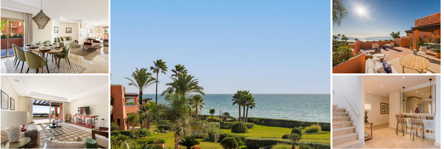
Penthouse ARENA - Marbella EAST (Los Monteros)