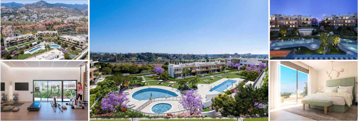
ELEONOR middle floor apartment - South facing and New construction - Estepona / Atalaya

The apartment is ideally located in the Atalaya area in Estepona, close from the prestigious Atalaya golf, Atalaya international school, shops and only few minutes away from Puerto Banus.