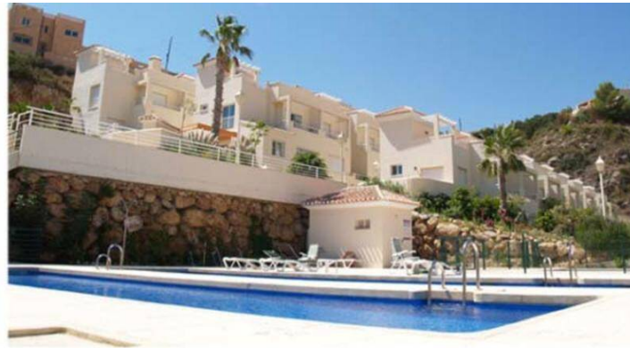
RESIDENCIAL LA ATALAYA 23 BROWN DAS ADOSADAS CON GARAJES, ZONAS COMUNES Y PISCINAS COMUNITARIAS PROMOTORA: EL PINAR DE BEDAR, S.A.