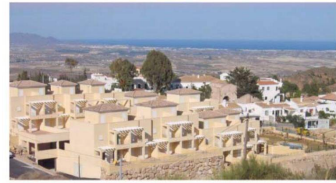
RESIDENCIAL LA FUENTE 4 VIVIENDAS ADOSADAS CON GARAJE, ZONAS COMUNES Y PISCINA COMUNITARIA. CERCA DEL PASEO DE BEDAR S.L.