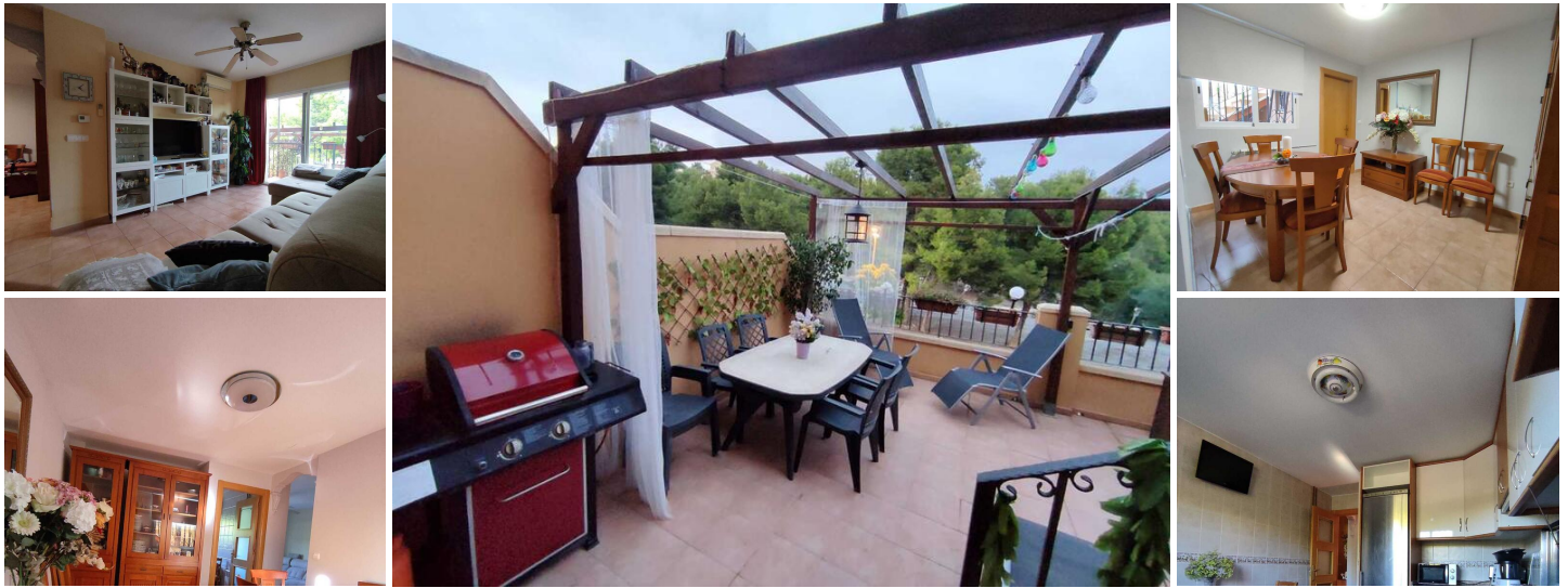
BEAUTIFUL TOWNHOUSE IN LA NUCIA

Townhouse situated in La Nucia, in a good location, with good access to main road, close to family parks, MasyMas supermarket, public transport and school bus stop, 8 minutes drive to Benidorm, 5 minutes drive to Alfaz del Pi and 5 minutes drive to La Nucia.