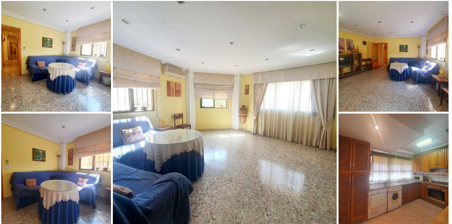
APARTMENT IN LA NUCIA

Centrally located apartment in La Nucia, in front of the park, close to the Specialities Centre, the post office, schools and high school, 5 minutes walk to the centre of La Nucia.