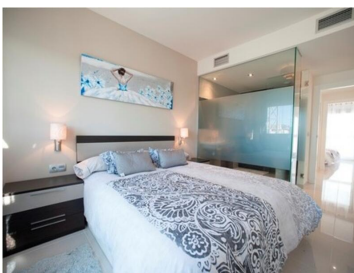
These brand new 2 bedroom, 2 bathroom apartments are located in Los Balcones and only a few minutes drive from the sea.

The properties consists of a lounge/diner with patio doors onto a sun terrace, an open plan American style kitchen fitted with all white goods, a master bedroom with en-suite, a further double bedroom and a guest bathroom.