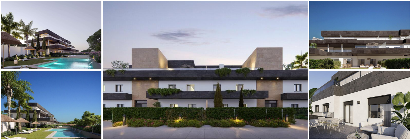
New Residential Complex Near Doña Julia Golf – Modern Homes with Spectacular Views