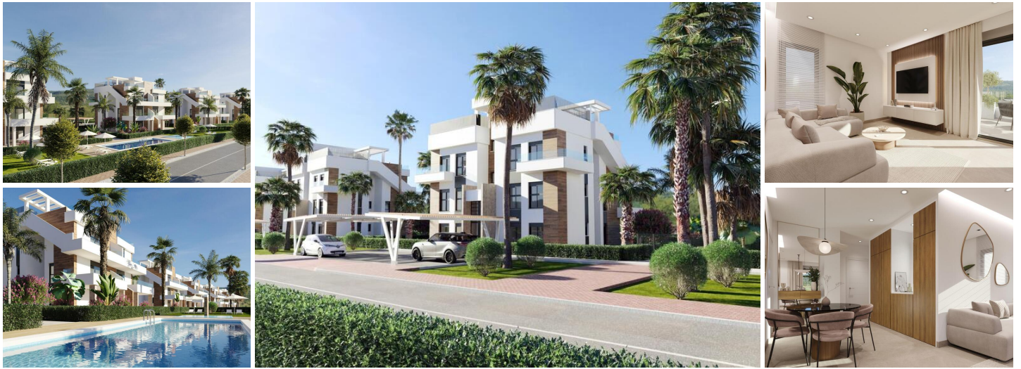
New Build Apartments in Hacienda del Álamo Golf Resort, Murcia