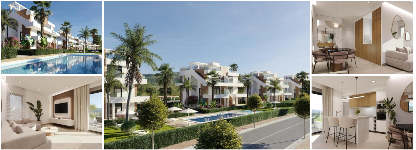
New Build Apartments in Hacienda del Álamo Golf Resort, Murcia