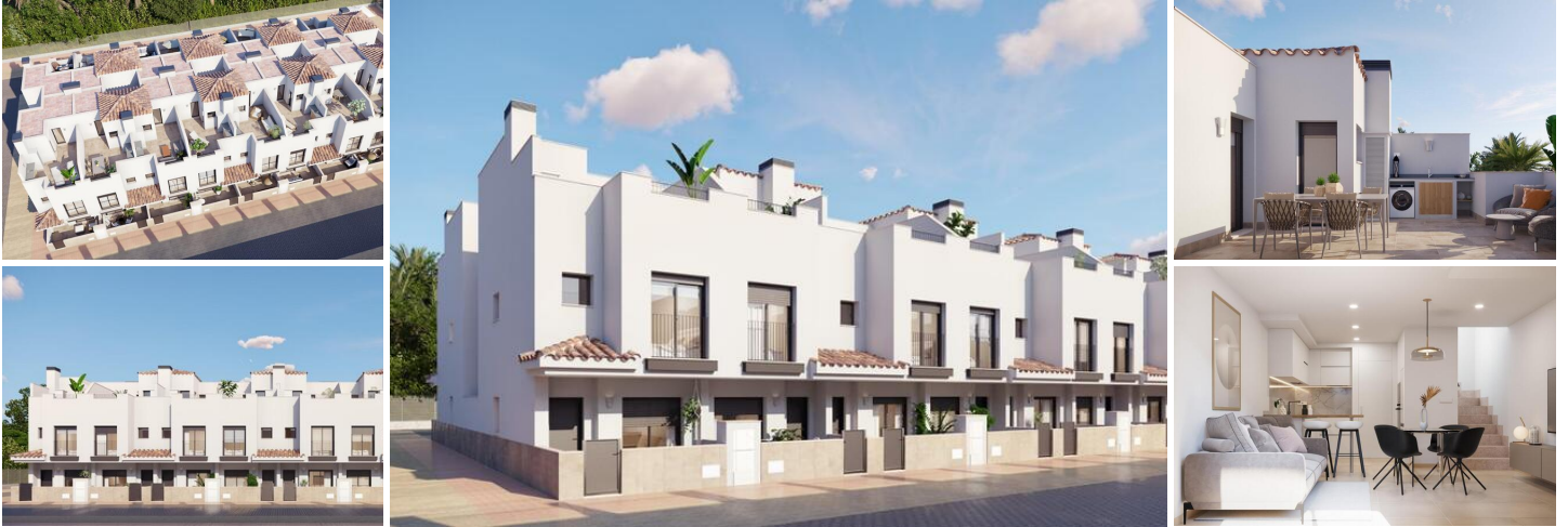
Modern Townhouses Near Golf Courses in Santa Rosalia-Murcia