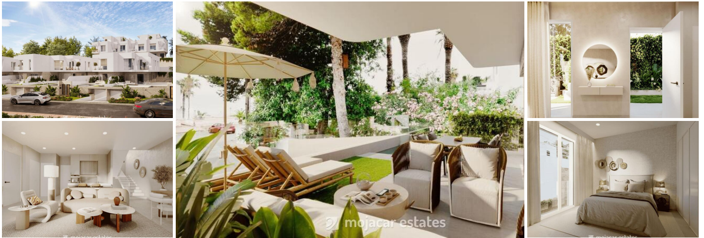
Off-Plan Homes 50m from the Beach – Mojácar Playa, Almeria, Andalusia

A rare opportunity to secure a brand-new home in a boutique frontline urbanisation of just 10 properties, ideally located only 50 metres from the beach on Mojácar Playa.