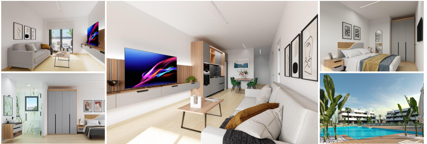
2-bedroom touristic flat with terrace, swimming pool and garage in El Raso, Guardamar del Segura

Upon entering, a small hall welcomes you and leads directly to the living room with integrated kitchen, a spacious and bright space that invites you to relax or share moments with family and friends. From the living room, you can access a spectacular terrace of more than 20 m 2 , perfect for breakfast in the sun, reading or enjoying warm summer nights. The flat has two bedrooms: the master bedroom, which is spacious and has an en-suite bathroom, and a second bedroom with space for two beds, next to an additional bathroom.