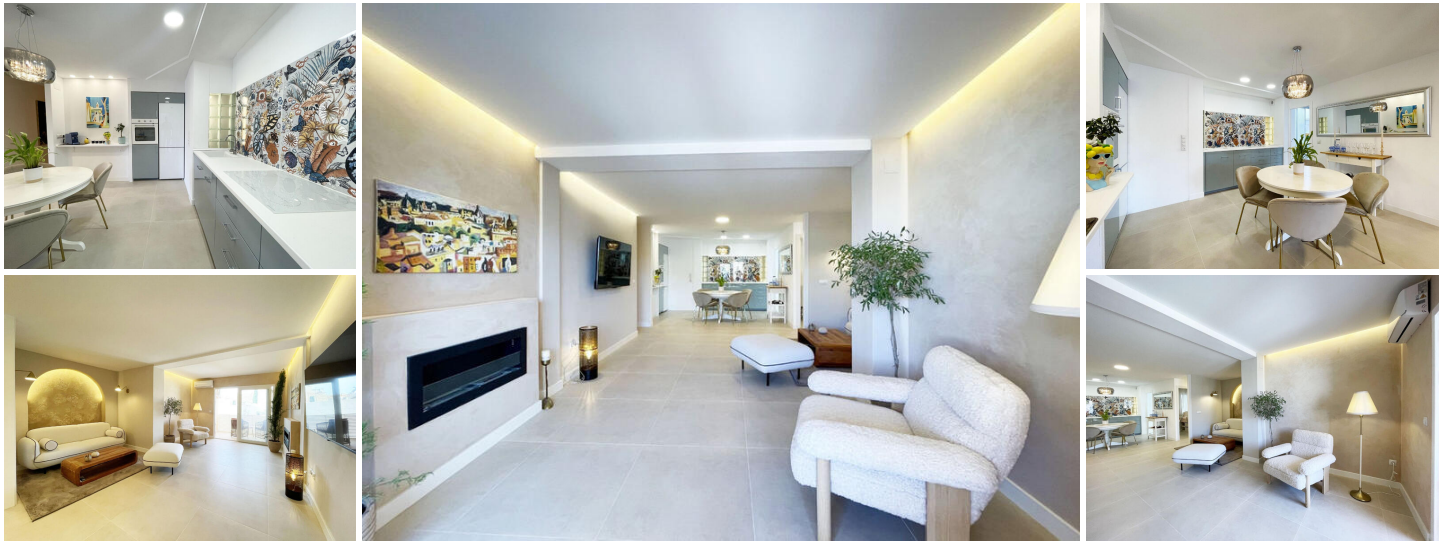
strong>Renovated Apartment in Calpe – Costa Blanca

This renovated 103 m 2 apartment offers space and comfort, with an excellent location close to all services. The property features 2 large bedrooms, a small children's bedroom, 1 full bathroom and 1 en-suite bathroom, as well as a bright living room with an open-plan kitchen. It also includes a covered terrace with pleasant views of Olta mountain.