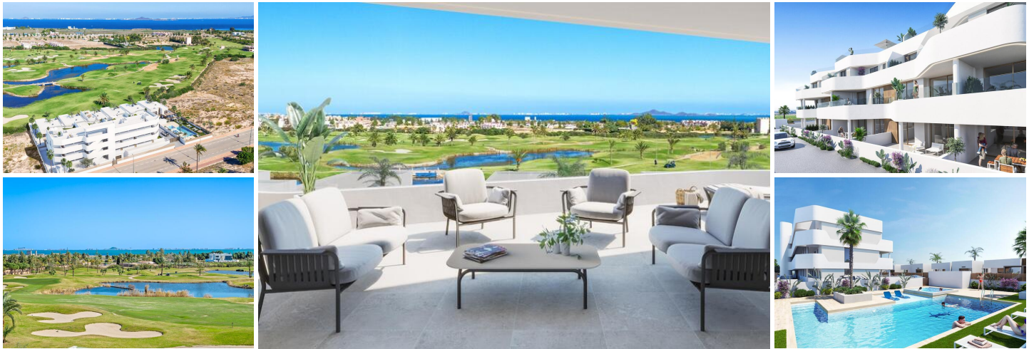
New Build Apartments and Villas Frontline Golf in Los Alcazares Costa Calida