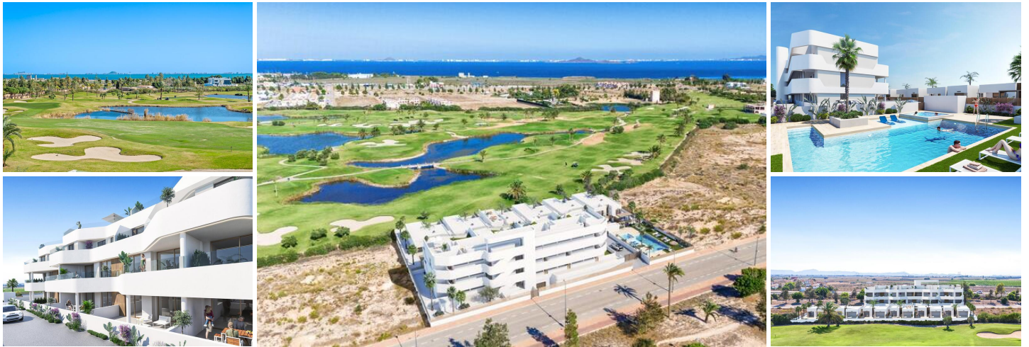
New Build Apartments and Villas Frontline Golf in Los Alcazares Costa Calida