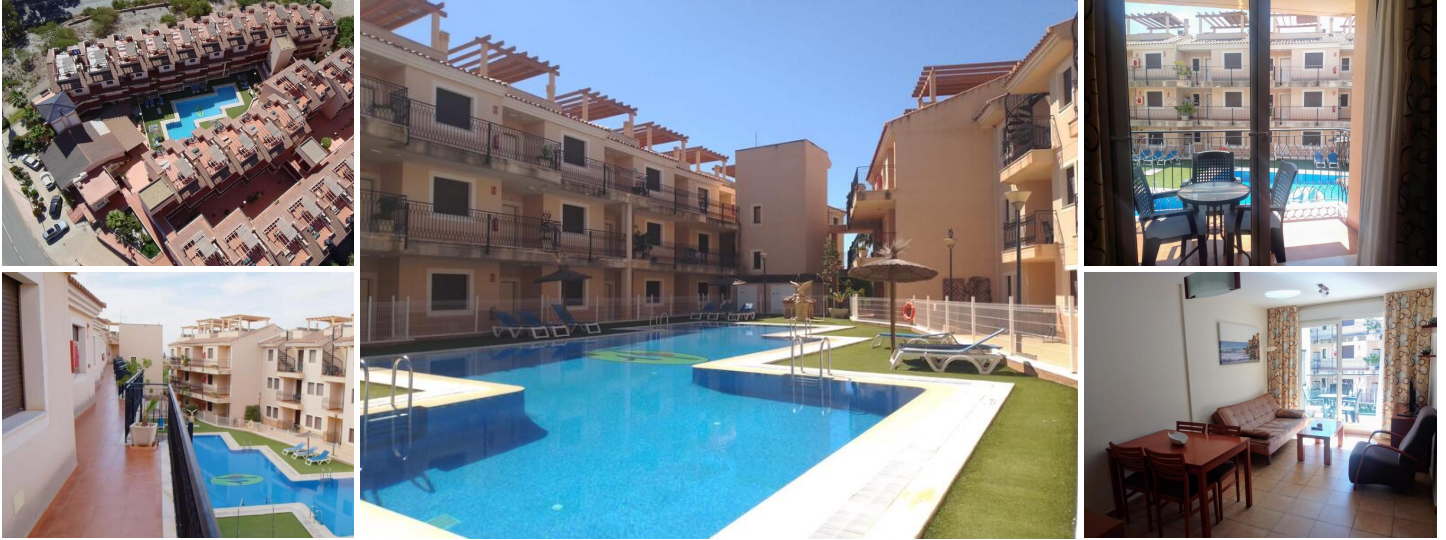
Tourist Apartments for Investment Near the Beach in Aguilas-Murcia