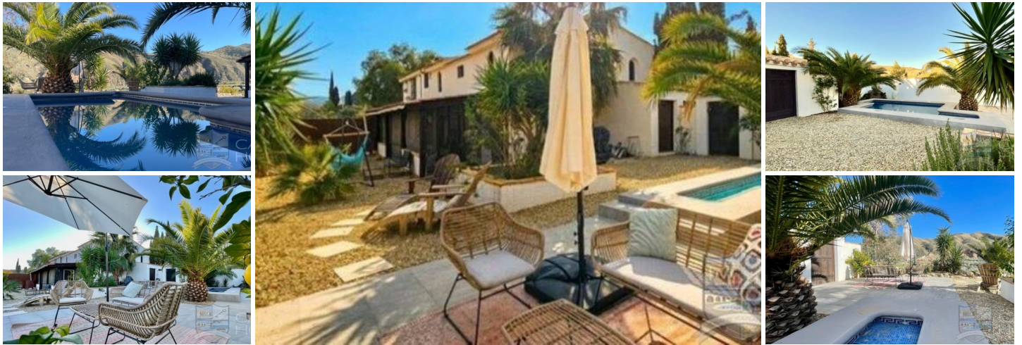
Casa Valley – A Beautiful 4 bed, 2 bath home with private pool set in the Cantoria valleys.

This stunning 4 bed, two bath country house can be found through the peaceful valley of Huerta de Judas in Cantoria, the landscape opens into a scene of olive groves, mountains, and endless sky. Just a few minutes from the vibrant town of Albox.