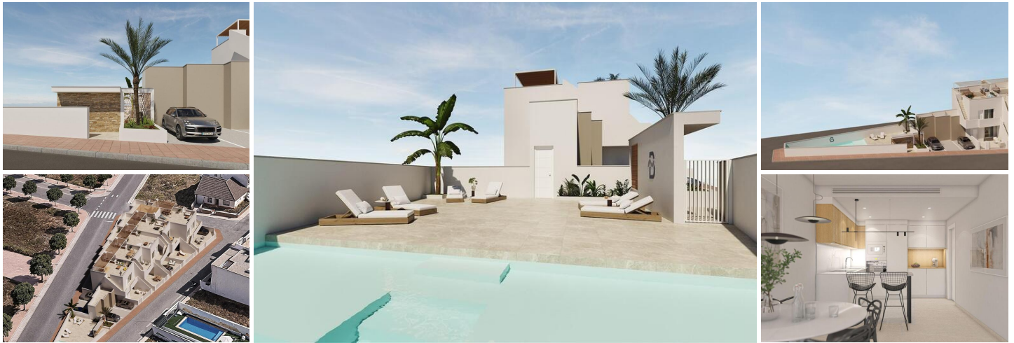
Modern Apartments with comunal Pool Near the Beach in San Pedro del Pinatar