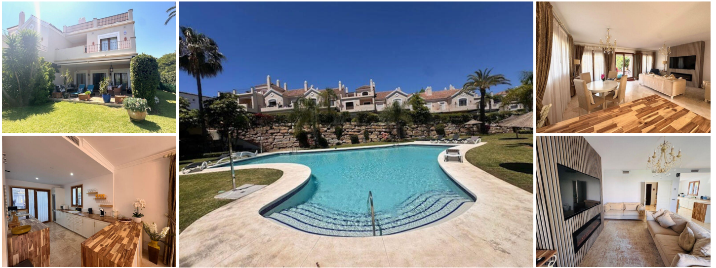
Beautiful 4-Bedroom Townhouse for Short-Term Rental in Paraiso Hills

Step into this spacious and inviting townhouse, perfectly designed for comfortable holiday living. Upon entering, you're welcomed by a bright entrance hall that leads into an open-plan living area featuring a cozy fireplace—ideal for cooler evenings. The space seamlessly connects to a dining area and a fully equipped kitchen, creating a warm and functional environment for family gatherings.