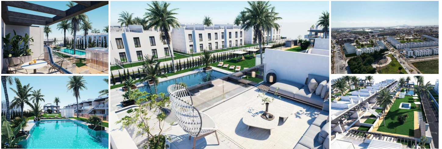
New Build Bungalows with Garden or Solarium Near the Beach in Pilar de la Horadada