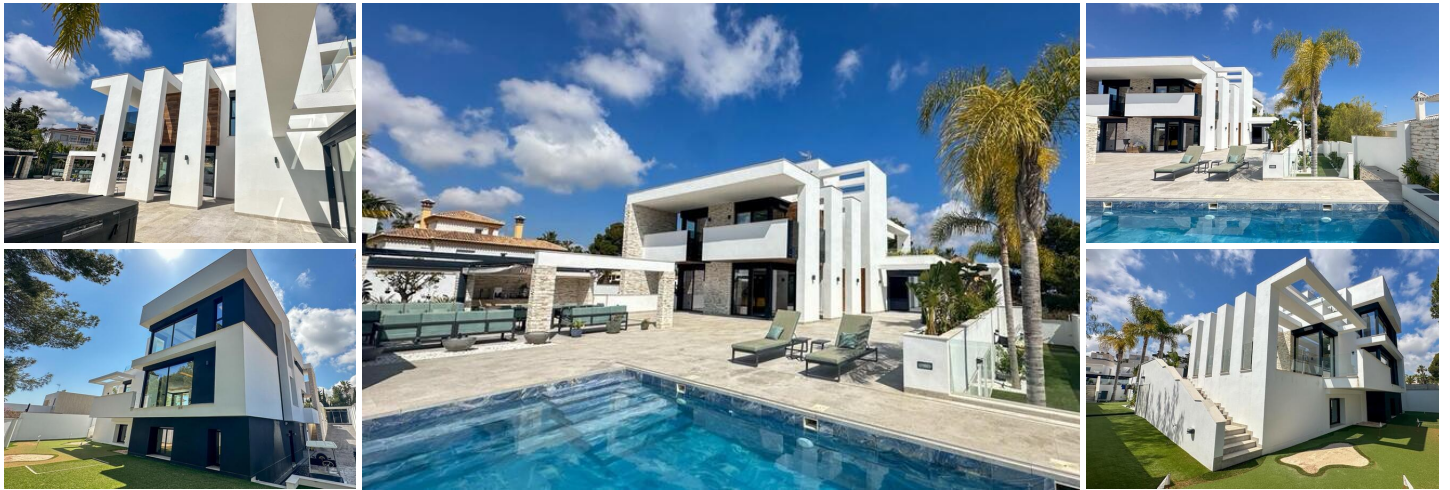
Ultra-Luxury Golf & Sea View Villa in Villamartín – The Pinnacle of Mediterranean Living

Indulge in the ultimate expression of luxury with this extraordinary villa in the heart of Orihuela Costa. Perfectly situated a minute from the elite Villamartín Golf Club, this residence offers seamless access to gourmet restaurants, chic bars, premium services, and boutique shopping. The golden sands of the Costa Blanca and the renowned La Zenia Boulevard are just five minutes away, while international travelers benefit from unmatched connectivity between Alicante–Elche Miguel Hernández Airport and Region of Murcia International Airport.