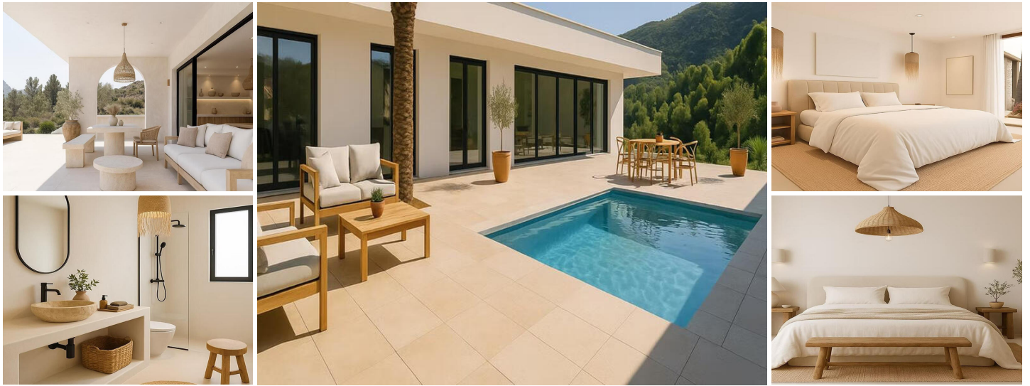
Stunning Ibiza-Style New Build with Panoramic Views – Monte Solana

An exceptional opportunity to build a modern Ibiza-style villa on a sunny south-facing plot in the highly desirable Monte Solana area. With licence already approved and ready to commence construction, this turnkey project offers breathtaking open valley and mountain views and a seamless blend of design, light, and lifestyle.