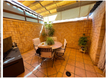
Exclusive Townhouse in Elche

Discover this magnificent townhouse with 4 bedrooms and 3 bathrooms, located in one of the most sought-after areas of Elche. A spacious and bright property in excellent condition, perfect for families seeking comfort, space, and quality of life.