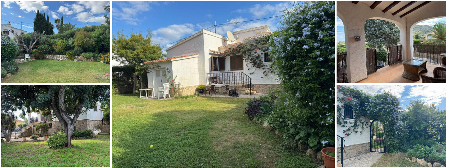
Charming Countryside Villa with Mountain Views – La Xara, Dénia

Discover this hidden gem nestled in the peaceful countryside of La Xara, offering spectacular mountain views and a true sense of privacy while remaining close to all amenities.