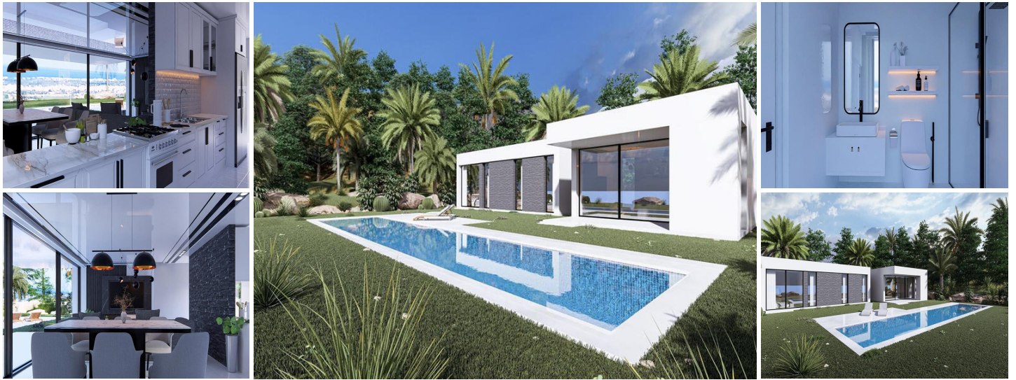
Cabrera-Style Villa Project – Custom Design Opportunity in Monte Solana, Pedreguer

Starting from €635,000, this beautiful Formentera-style villa project is set on a sunny south-facing 800 m 2 plot in the highly desirable Monte Solana area of Pedreguer, offering open views, tranquility, and excellent connectivity.