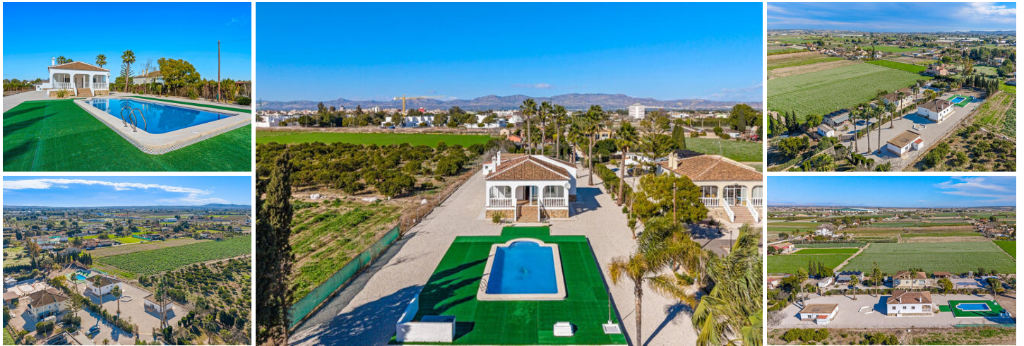
CHARMING COUNTRY FINCA WITH PRIVATE GARDENS IN DOLORES

Set in a peaceful rural location just outside the charming town of Dolores, this beautifully presented country finca offers authentic Mediterranean living surrounded by open farmland and year-round greenery. Located on a private cul-de-sac road, only residents access the lane, creating a very quiet and peaceful environment. The property also enjoys easy access to the surrounding areas of Almoradí, Algorfa, Ciudad Quesada, Guardamar del Segura, and La Marina, combining rural tranquility with nearby towns, coastal conveniences, and beaches just a 15-minute drive.