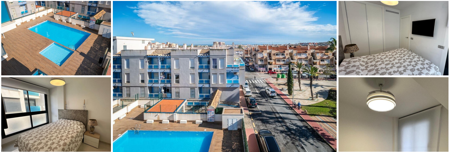
Modern 2-Bedroom Apartment with Terrace

This stylish 2-bedroom, 1-bathroom apartment is in excellent condition and is part of a modern building completed in 2022.