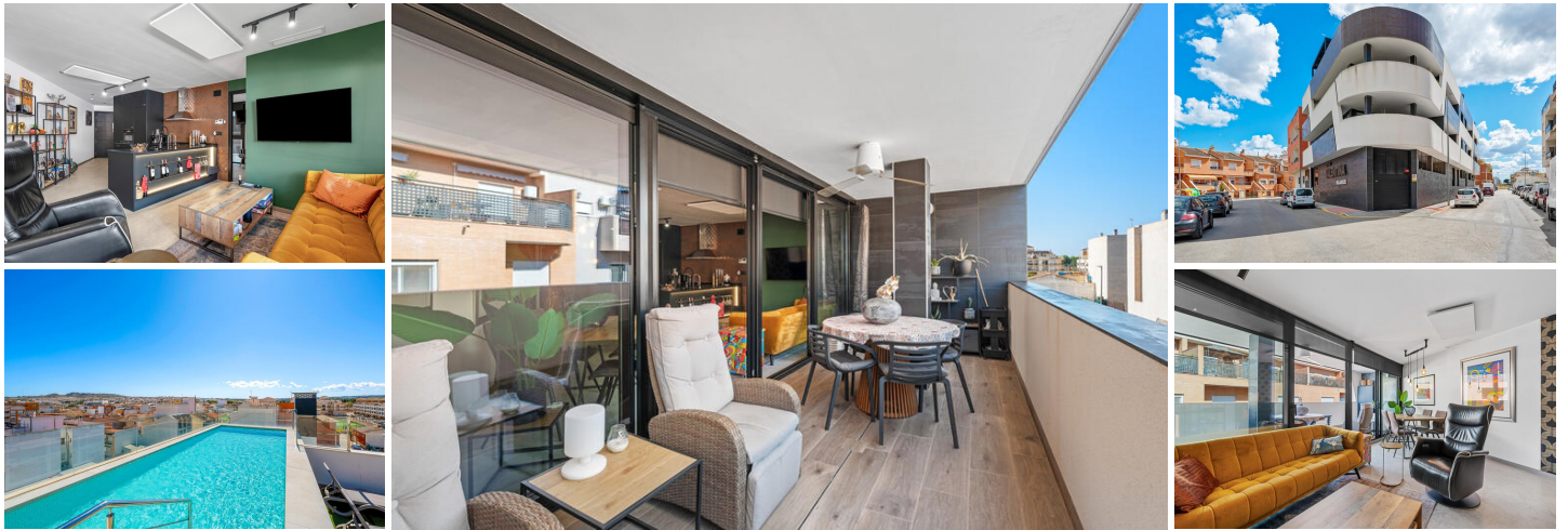
2-bedroom apartment with terrace in Edificio Valentina, Formentera del Segura

Located in the Edificio Valentina in Formentera del Segura (Alicante), this apartment stands out for its contemporary design, natural light, and quality finishes.