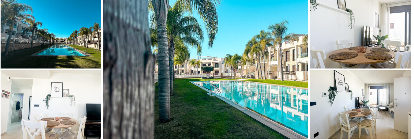
Modern Top-Floor Bungalow with Private Roof Terrace in Los Balcones, Torrevieja

This stylish top-floor bungalow is located in the highly sought-after area of Los Balcones, Torrevieja, just a short distance from the sea and prestigious golf courses, offering the perfect balance between coastal living and leisure.