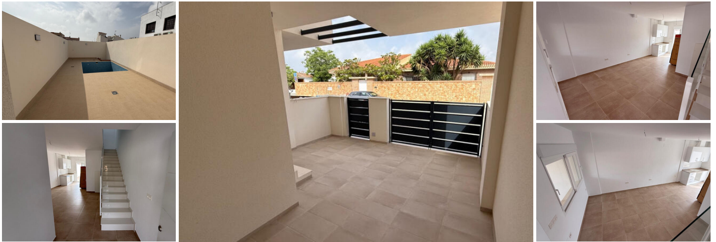
Modern 3-Bedroom Adosado with Private Pool – Built in 2024

Discover exceptional privacy and tranquility in this sleek, newly built (2024) modern adosado. Featuring 3 bedrooms and 2 bathrooms, the home offers 120 m 2 of living space on a 130 m 2 plot.