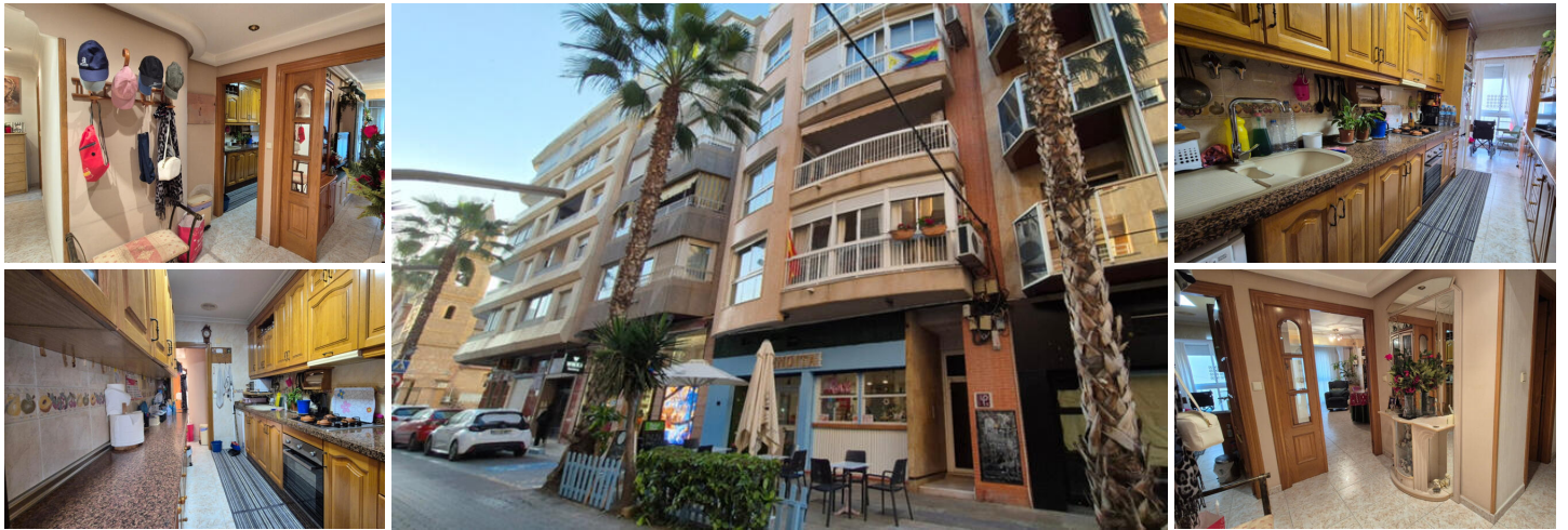
Spacious 3-Bedroom, 2-Bathroom First-Floor Apartment in the Heart of Torrevieja

Located in the vibrant centre of Torrevieja, this well-maintained first-floor apartment offers the perfect blend of comfort and convenience. The property features three generously sized bedrooms and two bathrooms, one of which is an en-suite to the master bedroom.