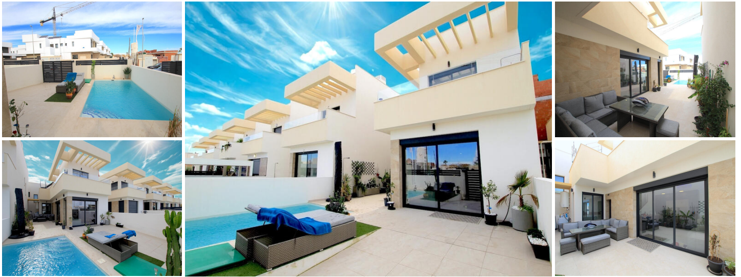
Stylish and Contemporary 3-Bedroom Villa in La Herrada, Los Montesinos

Introducing a stunning modern villa for sale in the sought-after residential area of La Herrada, Los Montesinos — a charming and well-established development offering a relaxed lifestyle with convenient amenities. The development features its own commercial centre with a easteries, and a supermarket, all within easy reach.