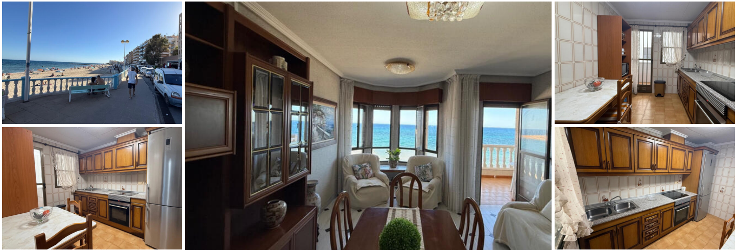
Stunning Frontline Apartment in Playa de los Locos, Torrevieja

Experience Mediterranean living at its finest with this immaculate frontline apartment located directly on Playa de los Locos, one of Torrevieja's most sought-after beaches.