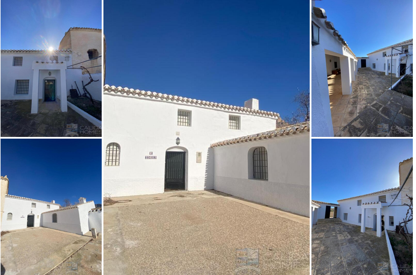
Cortijo Vigas – Vélez Rubio – €180,000, a stunning cortijo full of Character at a great price.

Cortijo Vigas is an impressive semi-detached farmhouse set in a peaceful rural location, offering spectacular open views and a high standard of renovation throughout. The property has been completely refurbished using quality materials and is thoughtfully arranged over two floors, providing spacious and versatile accommodation along with generous outdoor areas, ideal for enjoying the warm climate of the Vélez region.