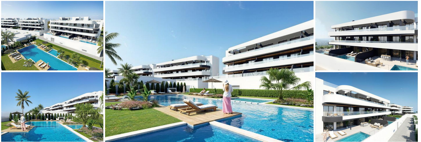
New Build Golf Front Apartments and Villas in La Serena Golf Los Alcazares