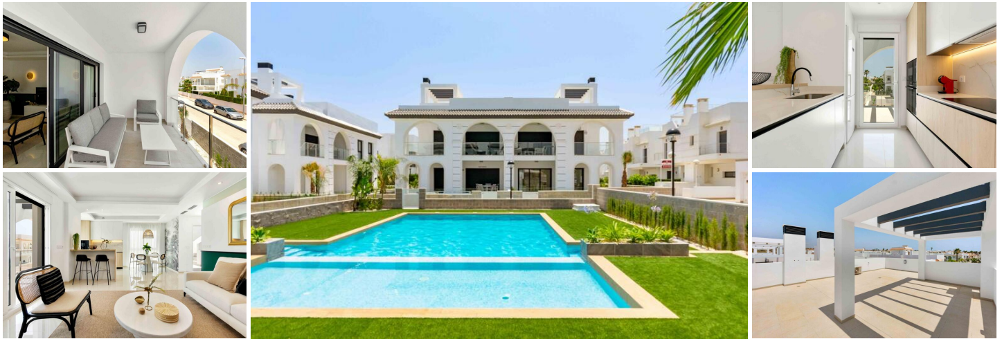
Luxury Penthouse with Private Solarium in Ciudad Quesada – Exclusive Living on the Costa Blanca

Discover this stunning penthouse for sale in the highly sought-after area of Doña Pepa in Ciudad Quesada, offering a perfect blend of modern design, comfort, and Mediterranean lifestyle. Situated within a secure, gated residential complex, this property is ideal for those seeking privacy, quality, and convenience on the Costa Blanca.