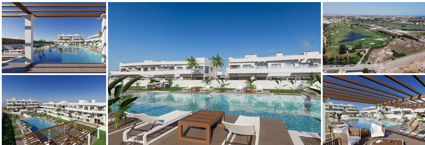
New Build Residential Complex Near Serena Golf and the Mar Menor in Los Alcazares